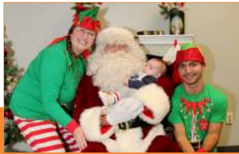
Santa and His Elves