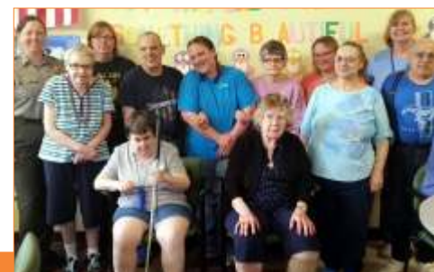
Partners with Mt. Morris Dam