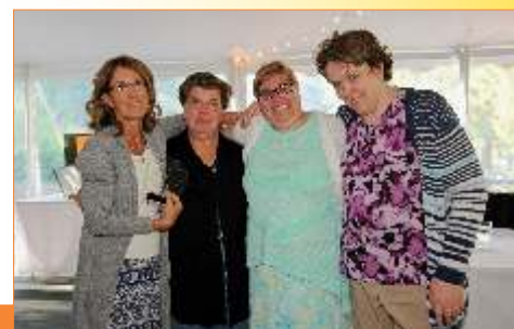
Finger Lakes Cookie Co. Friends