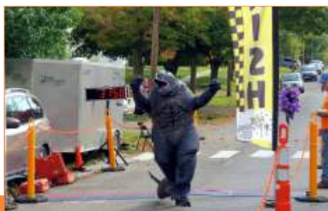
Godzilla Stomps Geneseo