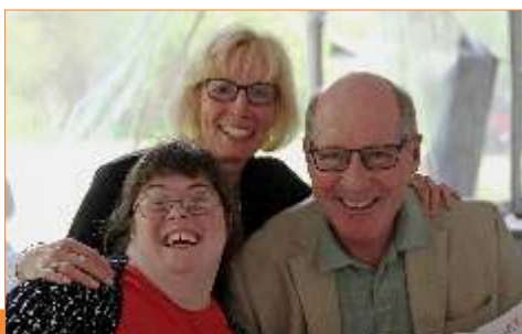
Fun and Family

In 2017, 92.3 cents of every dollar was spent on program services that directly help people experience the joys and challenges of life.