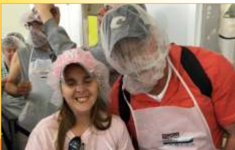
Recreation Trip to Hershey, PA