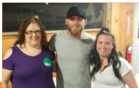
With Brantley Gilbert