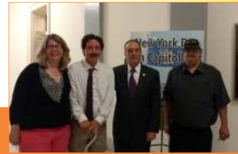
In DC with Rep. Chris Collins